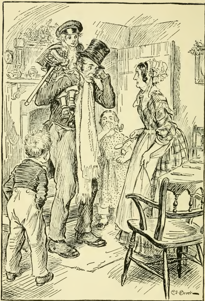
"—AND IN CAME LITTLE BOB "